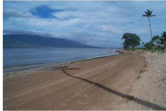
Waipuilani Beach at Maui Sunset