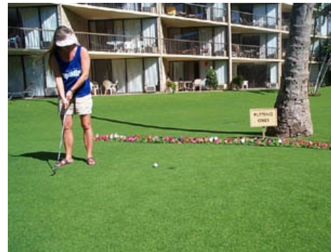
Golf putting green